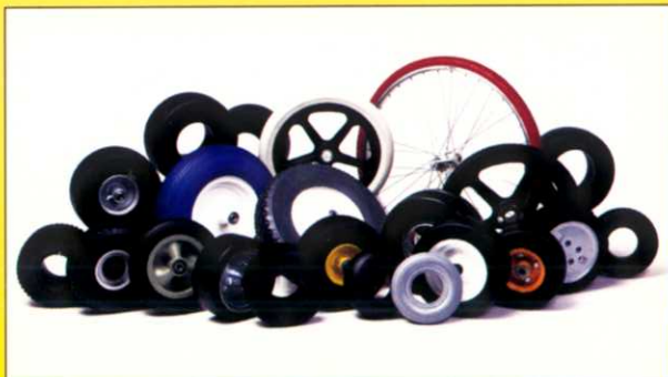
The Carefree Tire family.